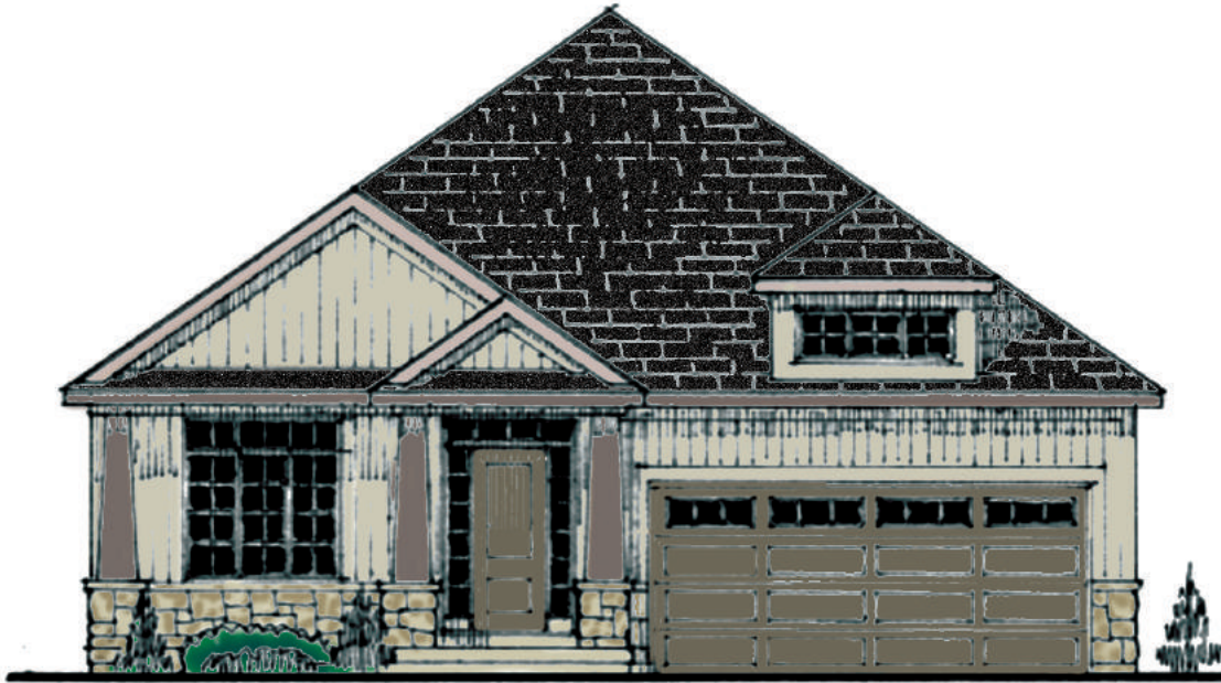
*Elevation shown with upgraded features*