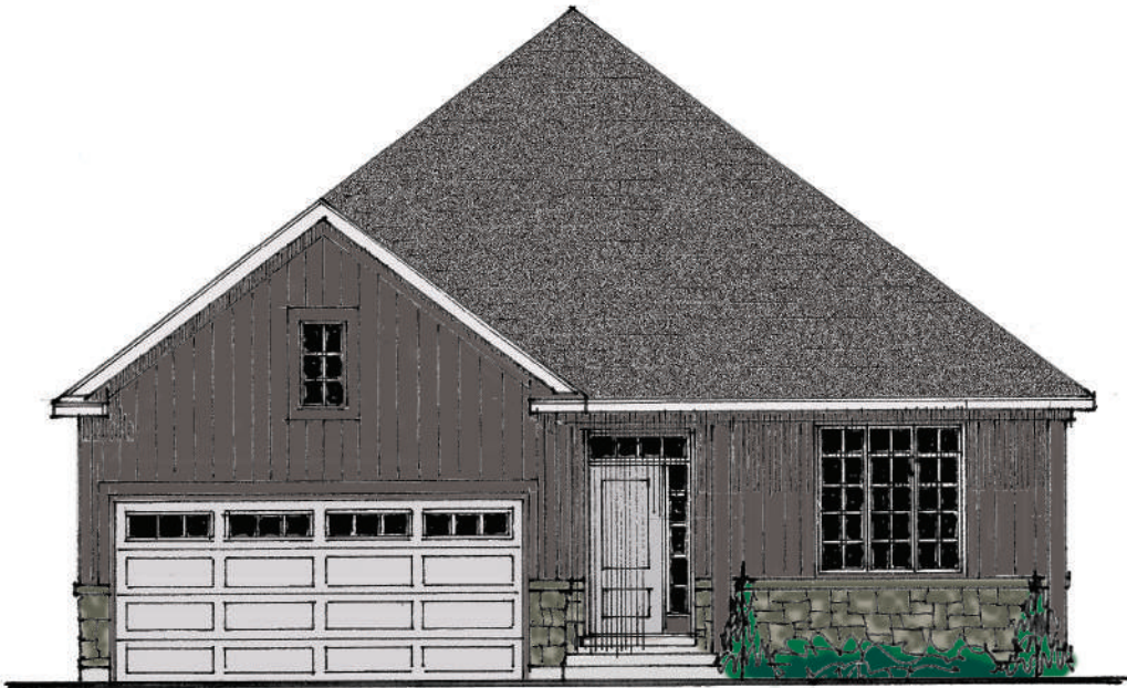
*Elevation shown with upgraded features*