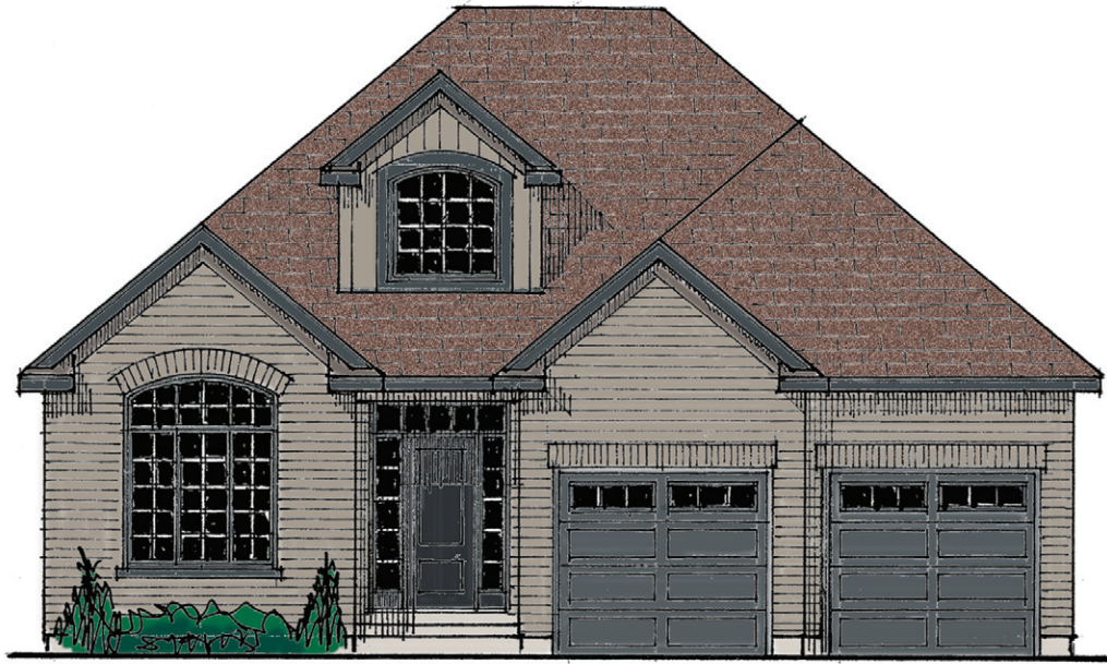
*Elevation shown with upgraded features*